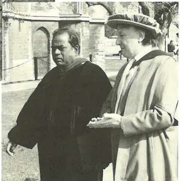
England talks to India of common concerns, shared history, and a future together through CUAC. Both look forward to faculty and student exchanges.