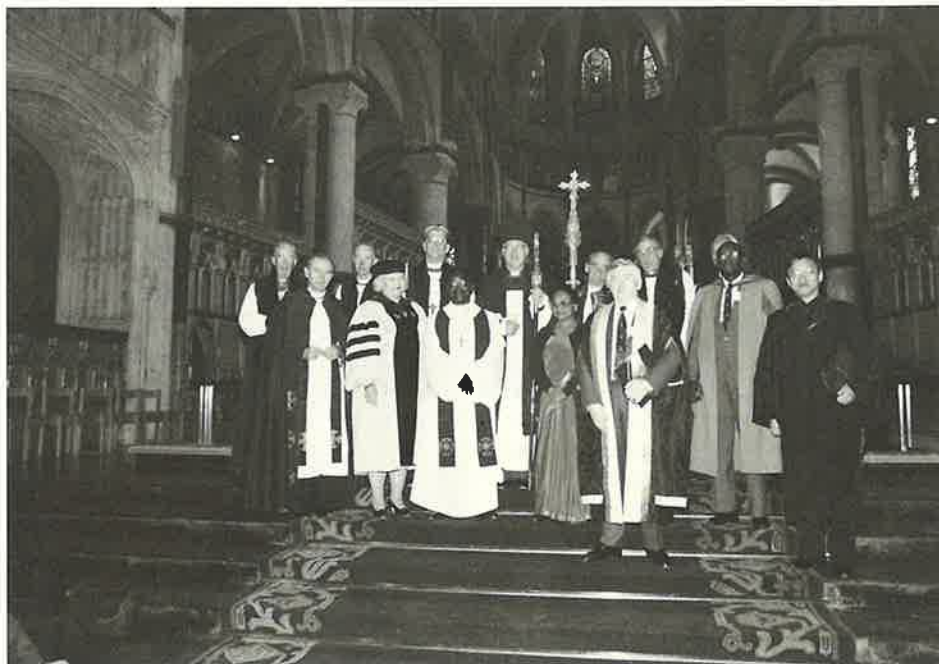
The highlight was the inaugural service at Canterbury Cathedral. The Archbishop of Canterbury, pictured above with bishops of 5 nations, College and Association heads, presided and preached. Lessons and intercessions were read in Japanese, Spanish, Tamil, Welsh, Chinese, Grebo, Filipino, and English.